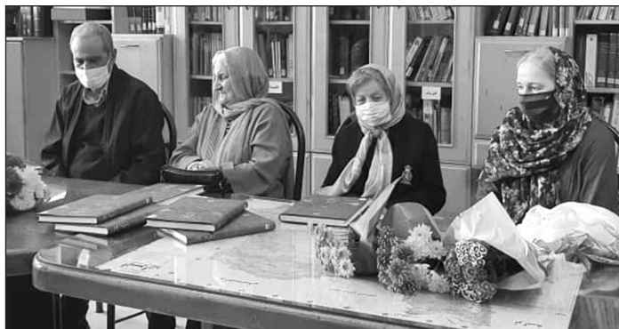
The encyclopedia volume launch ceremony