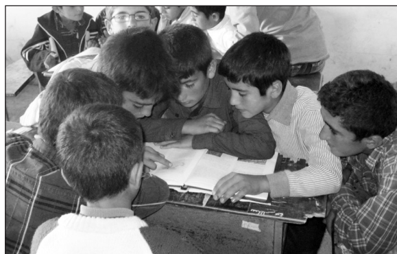
Promotion in schools and libraries in large cities as well as in deprived areas