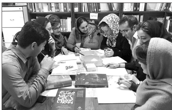
The art group

further funds was resolved during this time by a group of CBC members who established the association of the Friends of EYP to attract support, which continues today.