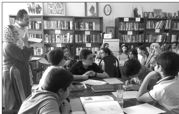
One of the young advisor groups