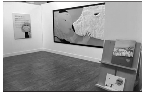
Exhibition at the Gunpo Culture & Arts Center