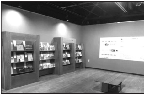
Exhibition at the Suncheon Picture Book Library