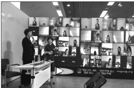
KBBY's online seminar